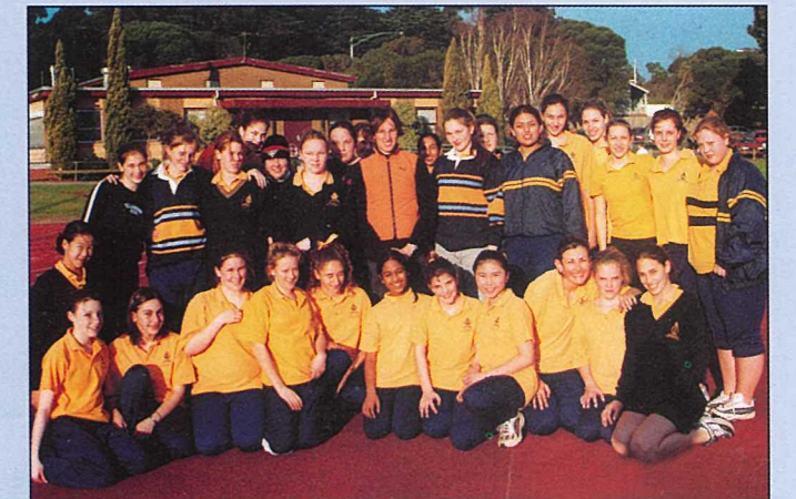
The athletics squad before their training session with Olympian Sarah Jamieson.