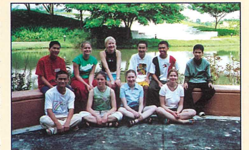
Lowther Hall students relax with host students at the Prem Tinsulanonda Centre for International Education.

During the final eight days of the trip the group was based at the Prem Tinsulanonda Center for International Education at Chiang Mai. They attended classes in Thai language and culture, cooking and pottery. They had opportunities to talk with students at the school as well as local children and adults and took trips to various places of interest around Chiang Mai.