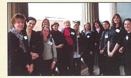
Members of the Class of 1986 enjoy exploring the Mansion after 15 years.