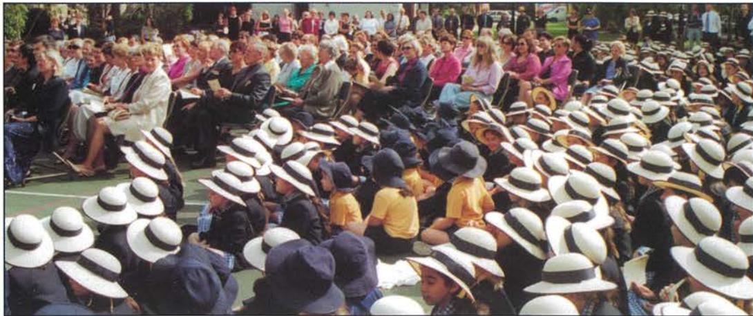
Students and friends of Lowther Hall attend the Opening Ceremony