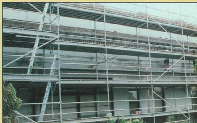
The rear face of the Mansion under restoration.

School families and any visitors to the Leslie Road campus during Term 1, will have noticed the major renovation work taking place on the rear face of Lowther Hall's historic Mansion. This building, originally known as "Earlsbrae Hall", was built as a private residence by brewer Coiler McCracken in 1890. The property was purchased by the Church of England in 1919 and Lowther Hall was established in 1920. The Historic Building Act has decreed the Mansion a building to "be preserved for the nation".