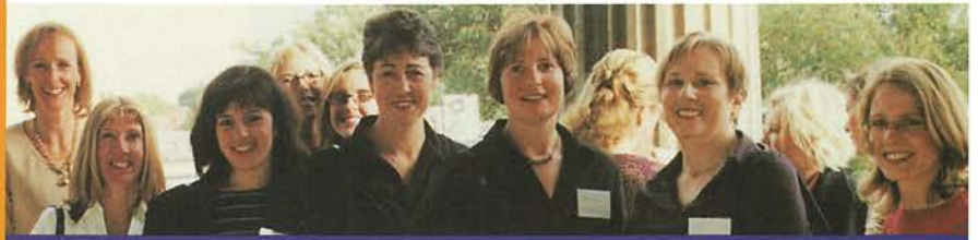
Class of 1983 Twenty Year Reunion Members of the Class of 1983 during a tour of the school.