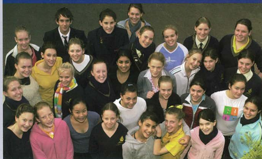
The cast of The Tempest take a break from rehearsals.

The Tempest will be staged in the Joan M Garde Cultural Centre, but as a change from recent dramatic performances, the seating will be in an unconventional arrangement, to create an intimate theatre experience.