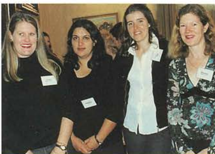
Class of 1988 Fifteen Year Reunion