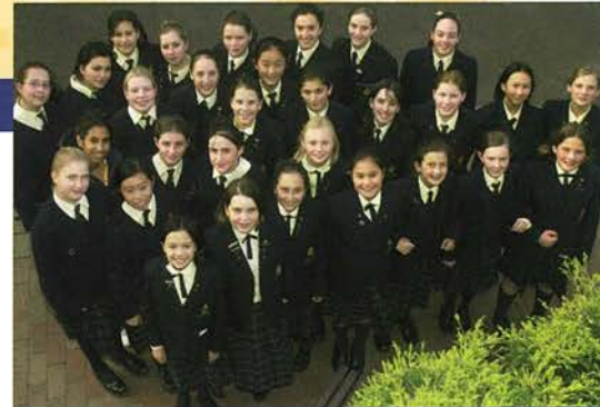
Members of the Senior Vocal Ensemble.

The Senior Vocal Ensemble also performed at the bi-annual Kodaly Choral Festival, held