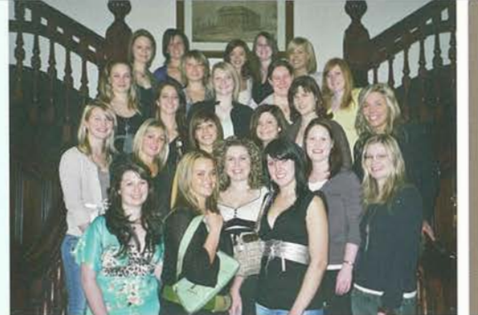
Members of the Class of 2001 celebrate their five year reunion in the Mansion.