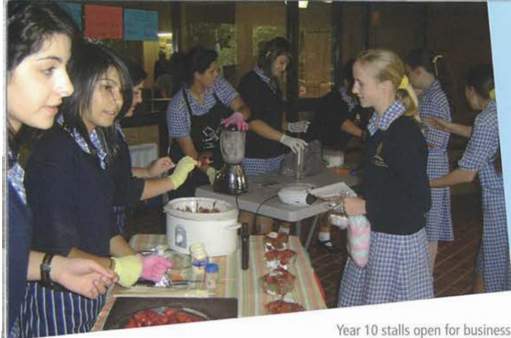
Year 10 stalls open for business.