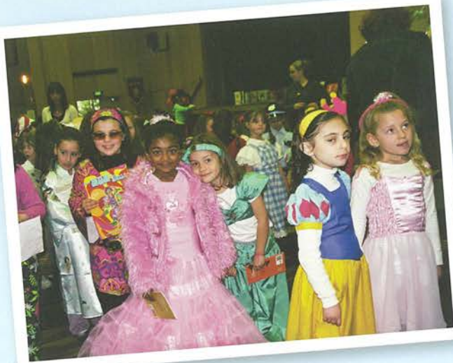
Year 2 students parade at assembly.