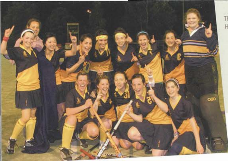
The victorious Under 17 Hockey Team.