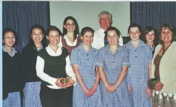
Year 8 students are greeted by Mayor Cr Jan Chantry and Moonee Valley Council staff at the Civic Centre.