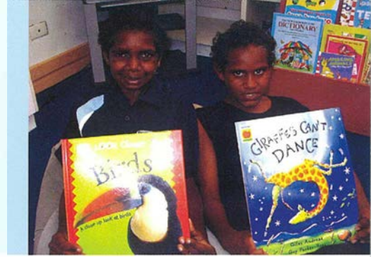
Yipirinya School students enjoy sharing the books donated by Lowther Hall.