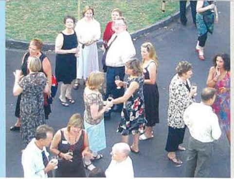
Some of the guests who enjoyed the 2007 parent, staff and School Council drinks party.