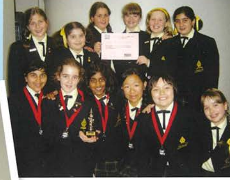
Junior School Chess teams.