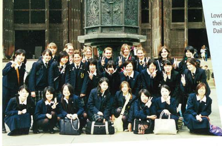
Lowther Hall students and their host sisters visit the Daibutsu temple at Nara.