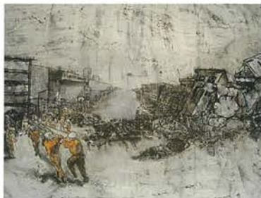
Yvonne Chan's work has been shortlisted for the prestigious Top Arts 2009 exhibition.