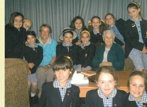
Community Choir members spend time with residents of Corandirk after their performance.