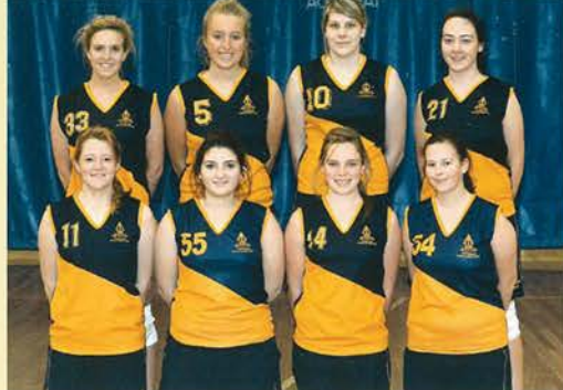
The Senior Soccer and Volleyball teams. GSV Zone Winners and overall finalists.