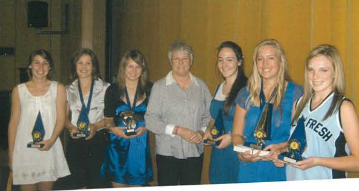
Olympian Raelene Boyle with major award winners at the Sports Awards Night.