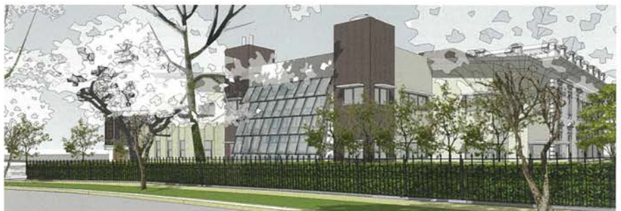
An artist's impression of the Science and Technology building.