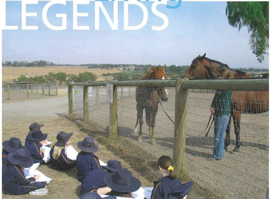
Year 3 students draw the Living Legends.