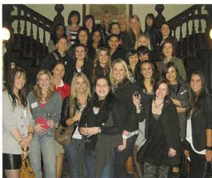
The Class of 2004 revisits the Mansion.

Please note Reunion Dates for 2010 below.