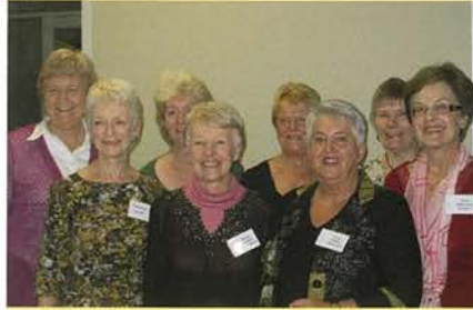
Members of the Class of 1959 welcomed to the Golden Mitre Club.

This special event, hosted by the Lowther Hall Old Grammarians' Association, celebrates past students who left the school fifty or more years ago and was held in the Forum on Saturday October 3.