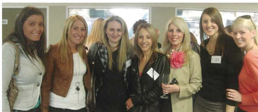
Members of the Class of 1999 get together at the Ten Year Reunion.