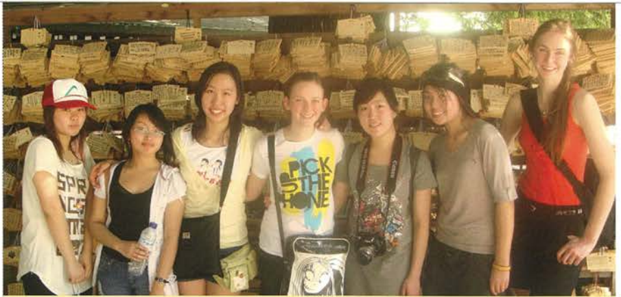
Lowther girls visit the Meiji Shrine in Tokyo.