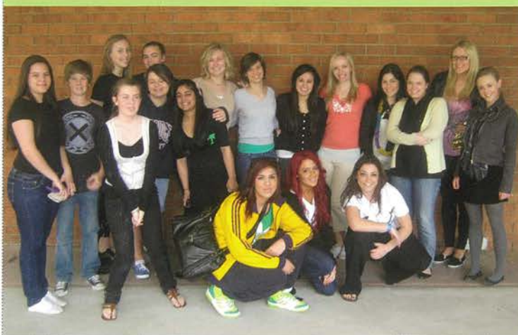
Lowther Hall students past and present who organised the Samoan Tsunami Benefit Concert.