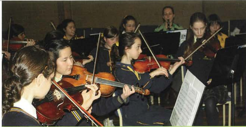
Orchestra members in rehearsal for the Spring Concert.

Music Day was held at the school on Saturday 15 August. This busy day allowed ensembles and their leaders the opportunity for concentrated practice leading up to the Spring Concert. This annual event, held on September 4 featured a number of the School's ensembles playing a variety of musical styles. It was thoroughly enjoyed by the large audience made up of members of the Lowther Hall community.