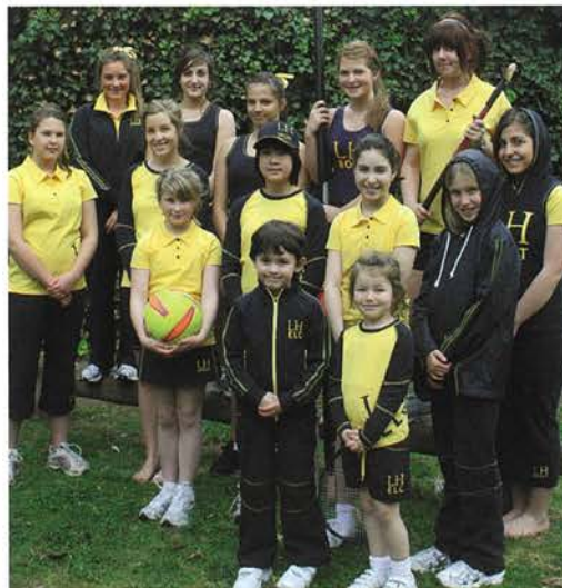
Junior and Senior School students present the new Sports Uniform.

This project benefits the girls through encouraging wider reading and also those who suffer from MS.